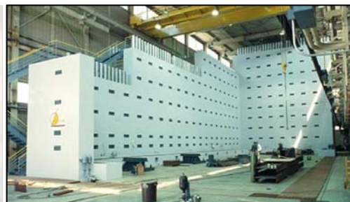
RTMD Equipment Site