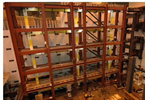
Seismic-Resistant Frame Systems